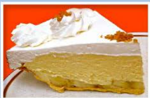
Banana Cream Pie